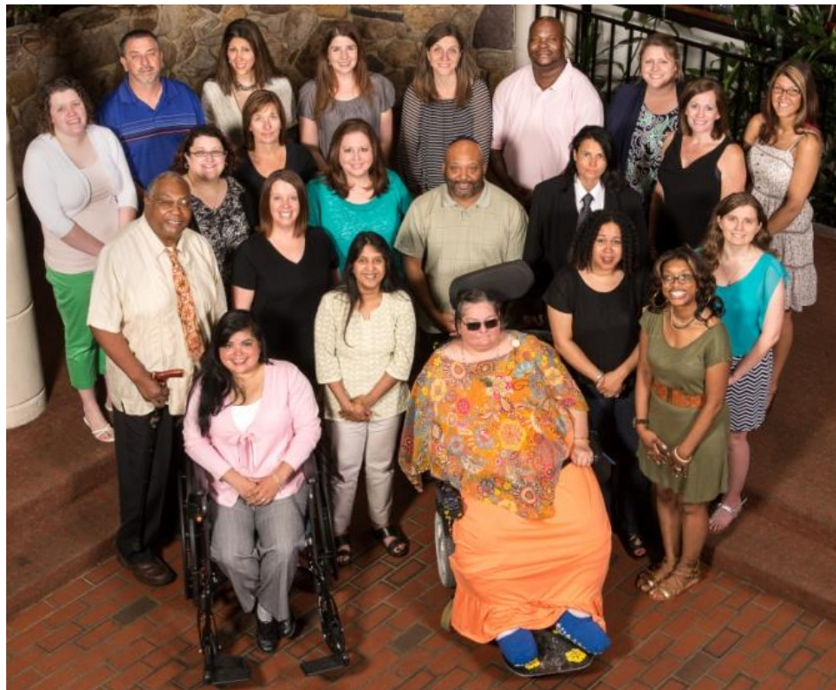
PIP Class of 2014

The Board helped plan two Disability & Aging conferences which had more than 240 total attendees. The Board's short documentary on the transition of individuals from institutions to community living, Place Matters , was shown at one of the conferences.